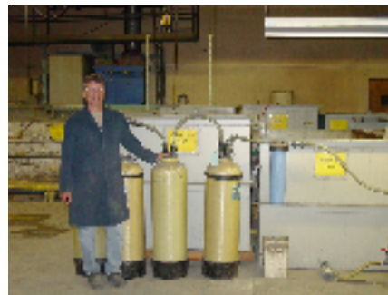
ION EXCHANGE SYSTEM