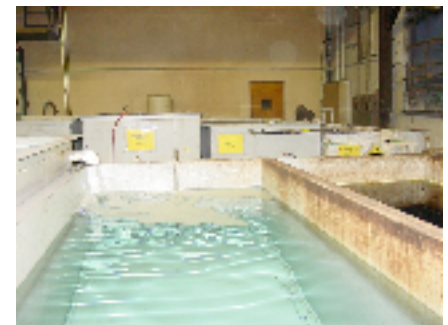
CLEAN RINSE WATER

Portland Powder cares about the environment, and cares about quality.